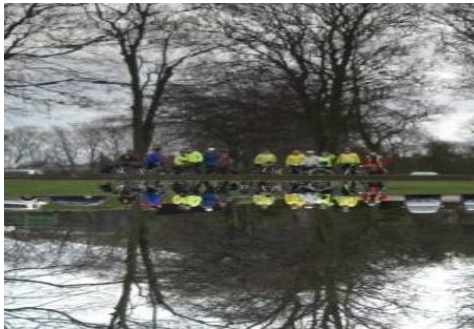
“Double Vision in Duthie Park”

In Amsterdam they tried such a scheme 40 years ago, the White Bike trials. They were painted white as the name suggests. The idea was that you could take one and leave it wherever you wanted to go. You didn't even have to pay for the service! That scheme failed miserably, probably because the city fathers overlooked the plain fact that man is not an idealistic animal.